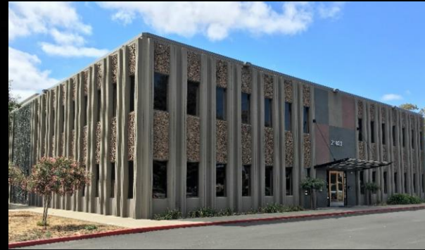
LakePharma Biomanufacturing Hayward, CA