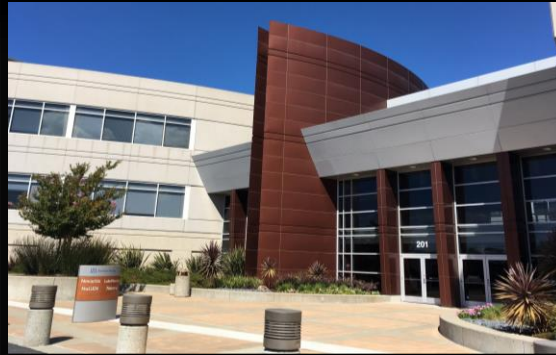
LakePharma Development San Carlos, CA