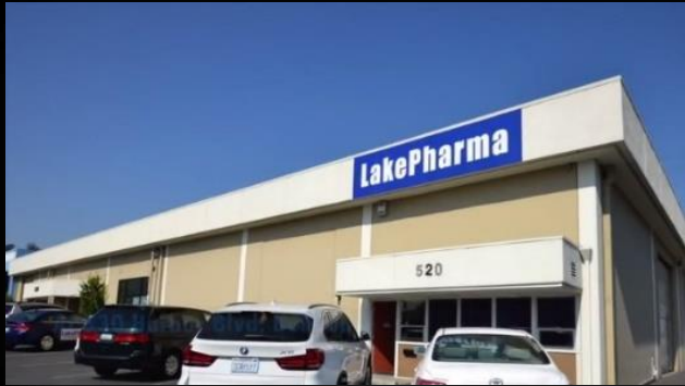
LakePharma Engineering Belmont, CA