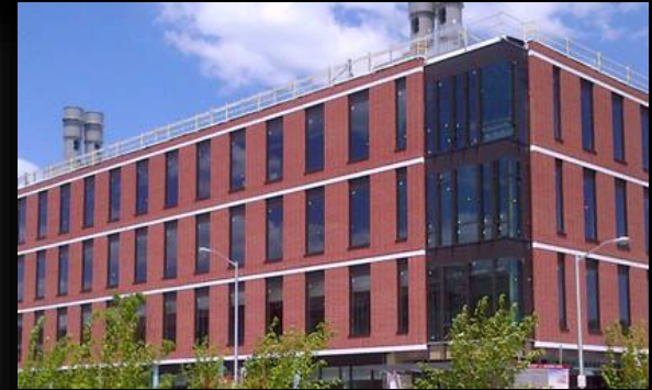
Blue Sky BioServices Worcester, MA